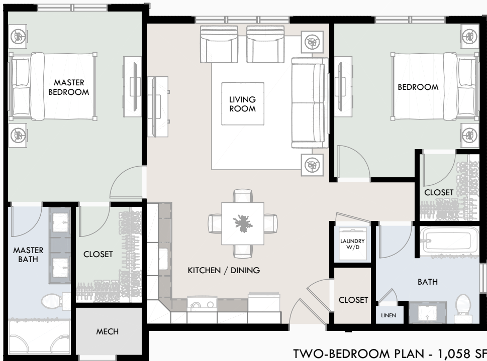
TWO-BEDROOM PLAN - 1,058 SF