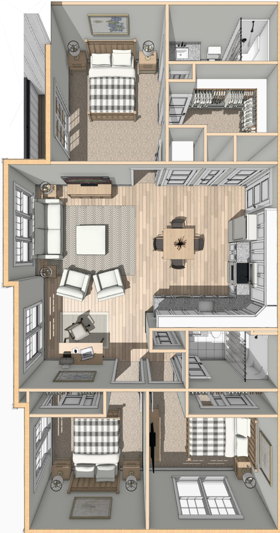
THREE-BEDROOM PLAN PERSPECTIVE